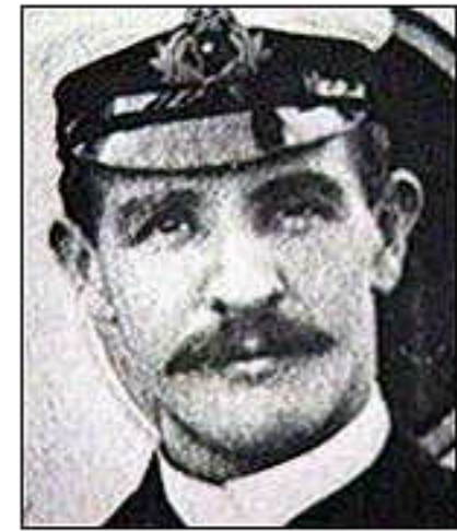
William Murdoch remembered as hero in home town

The world's most expensive movie - Titanic - has opened at cinemas across Britain, with no expense being spared on the set, costumes and stunning visual effects.