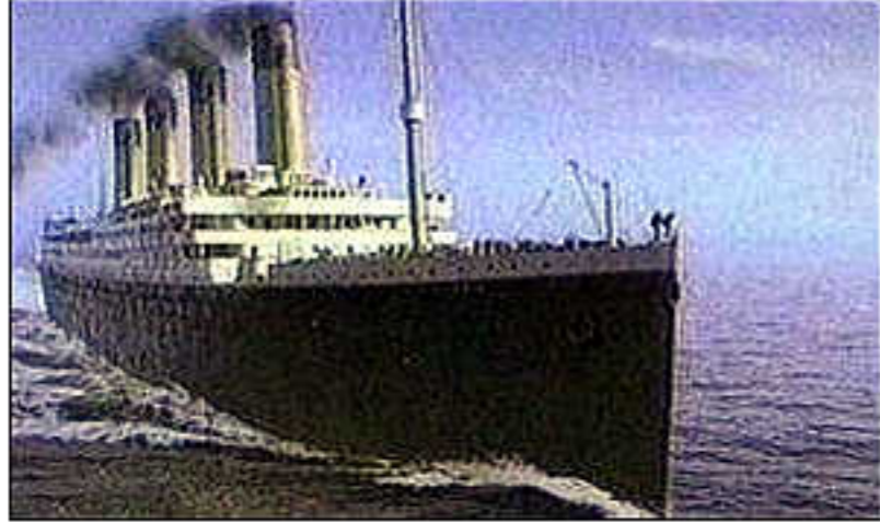
More than 1,600 people died when the liner sank

The world's most expensive movie - Titanic - has opened at cinemas across Britain, with no expense being spared on the set, costumes and stunning visual effects.