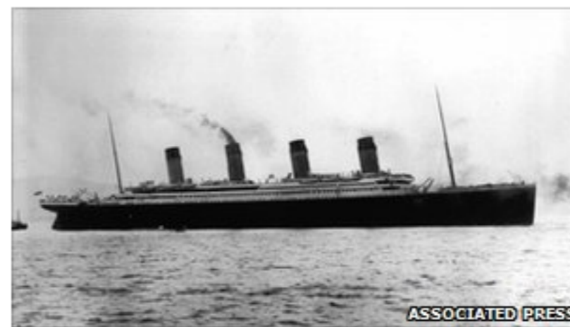
Historians say William Murdoch did his utmost to save passengers

A monument to the first officer, who went down with the Titanic in 1912, is displayed at Dalbeattie's town hall.